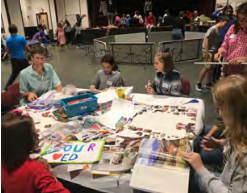
All-Youth Kickoff Event at The Brick Church